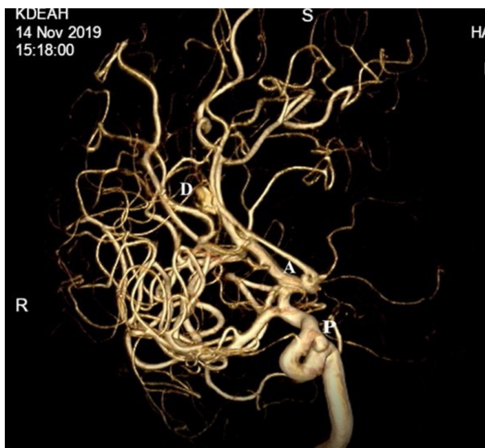
Figure 1. DSA image of a patient with multiple aneurysms accompanying bleeding DACA aneurysm. D: DACA A3 aneurysm, A: Anterior communicating artery aneurysm, P: paraclinoid carotid artery aneurysm

of accompanying hemorrhage, and Glasgow outcome scale (GOS) scores of the patients were evaluated (Table 1).